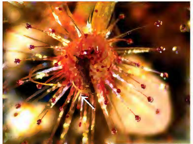
Figure 4: Drosera callistos captured a springtail, which is unable to escape using its furcula (arrow).